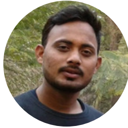
Akbar Program Lead