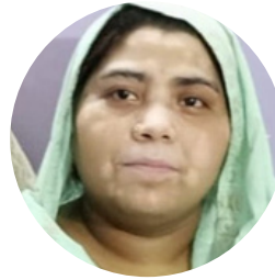
Shaheen Program Co-ordinator