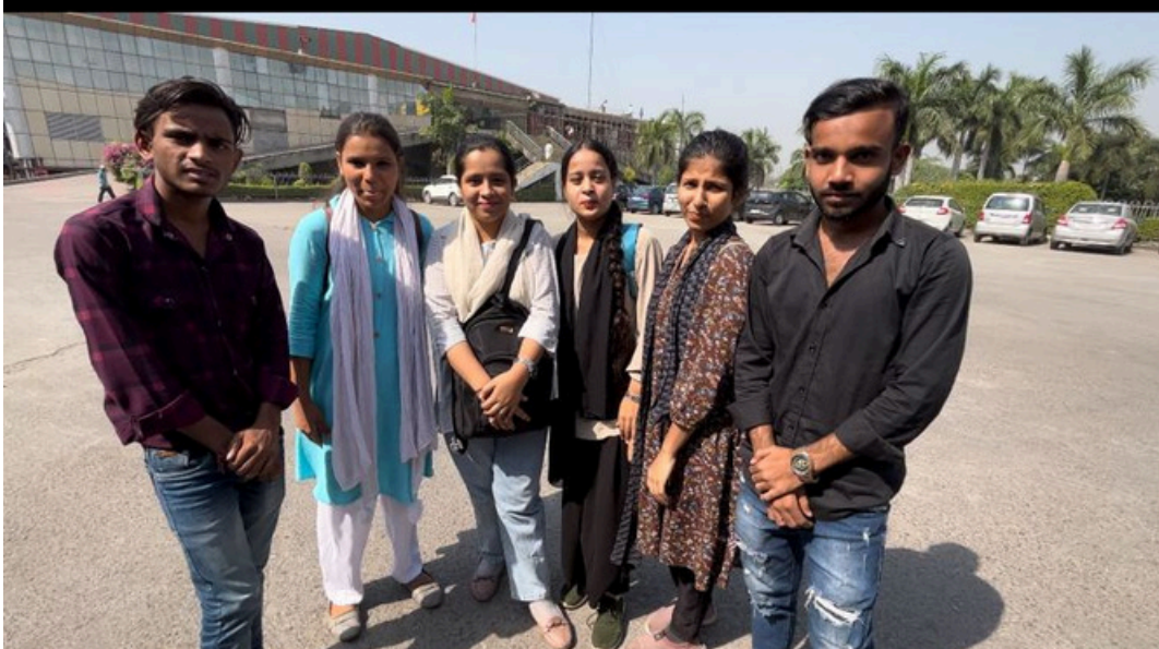
Food Technology Interns outside Priya Gold factory