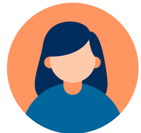
Muskaan Training Translator