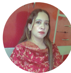
Al Sabha Trainer