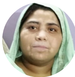
Shaheen Program Co-ordinator