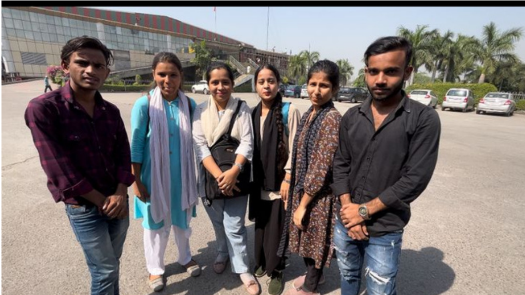
Food Technology Interns outside Priya Gold factory